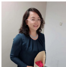
Luce Lv 02 9268 0086